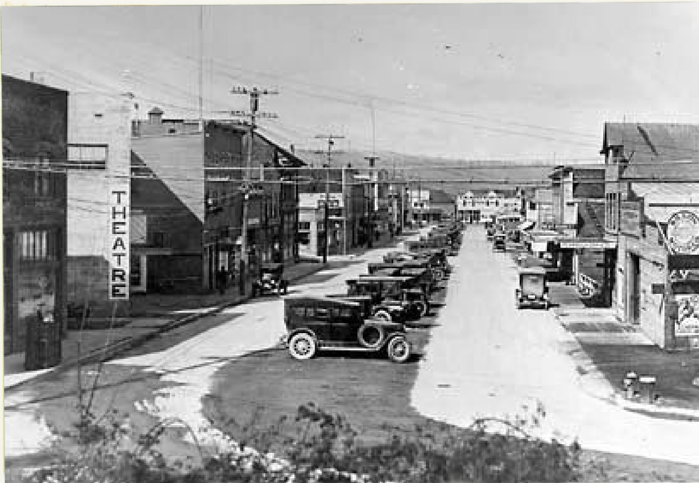
Bay Street 1920's

Port Orchard was platted in 1886, incorporated in 1890 and was the first town in Kitsap County. Its strategic position on Sinclair Inlet, the beautiful panoramic views of the Olympic Mountains and the abundant natural resources has always made Port Orchard a special place. As the County Seat and important port of call for the Mosquito Fleet Port Orchard was instrumental in the development of Kitsap County.